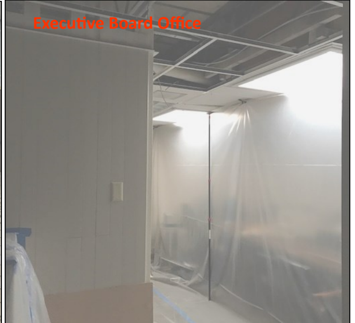
Executive Board Office

This is our latest shirt design, Get yours while they're in stock!